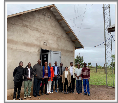
New Life Radio staff

YNOP is also raising $9,000 for a new generator for New Life Radio. Through New Life Radio, God's truth is spread throughout Tanzania for people who need His hope and peace.