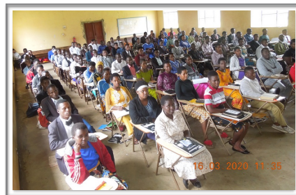
The first Bible school class of 2020 has 103 students. They have returned to their homes until schools reopen.