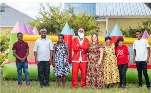
CHO staff and caretakers