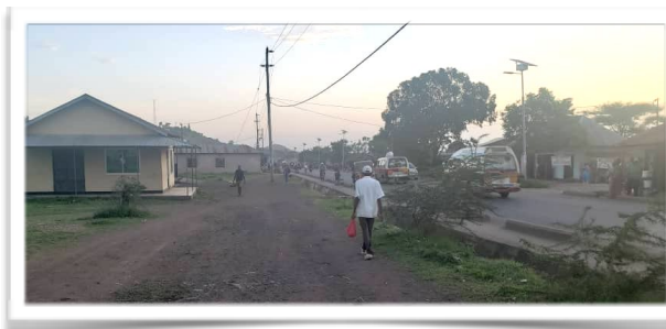
The church property (left) and main road (right)