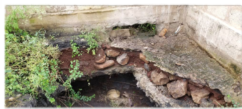
Sections in need of drainage or repair