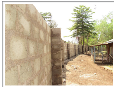
Wall being built around IEC campus