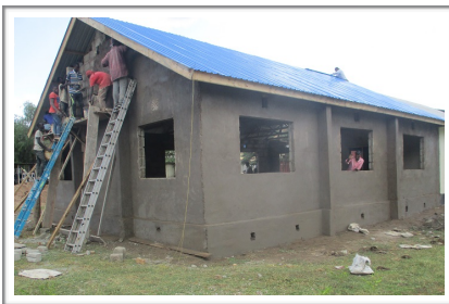
Construction of new Bible school library