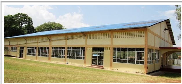
Newly repainted seminar hall