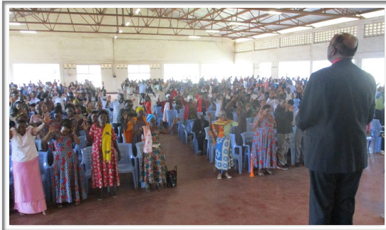
First Sunday back home at church in Sakila

The problem is very big, and it looks like the prices of everything will go up in the future. Please pray for Tanzania as life is now much more difficult for many people here.