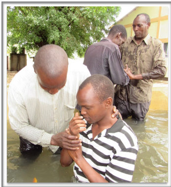
At the end of March, 48 of the current Bible school students were baptized!

Due to inflation and because of the war in Europe, prices in Tanzania are very high for gasoline, building materials, cooking oil, rice, and transportation. As you can see in the farm pictures, the corn we planted is already gone due to lack of rain this year. The price of food is also high, but we must start buying in the month of May.