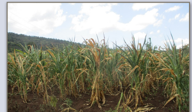
Corn crops failing due to drought

As noted in Eliudi's letter, drought and inflation have taken a toll on the people of Tanzania. We requested funds for food at harvest time last September, and the Lord provided for enough food to last several months. Now the food stores are dwindling, and prices have nearly doubled since last fall.