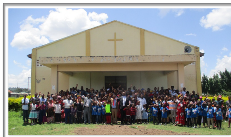
Church visitations in southern Tanzania