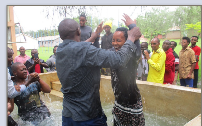
Baptism of 40 people in Sakila