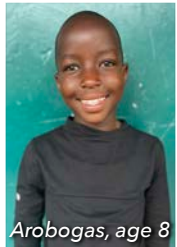
Arobogas, age 8